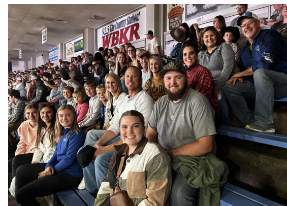
For this year's Fall event, LYO attended Owensboro Bulls & Ghouls PBR Bull Riding Event on October 26th.

St. Paul's Lutheran Church Mission Statement Worship Boldly, Empower for Discipleship, Cultivate Spiritual Maturity, Strengthen Community, Serve.